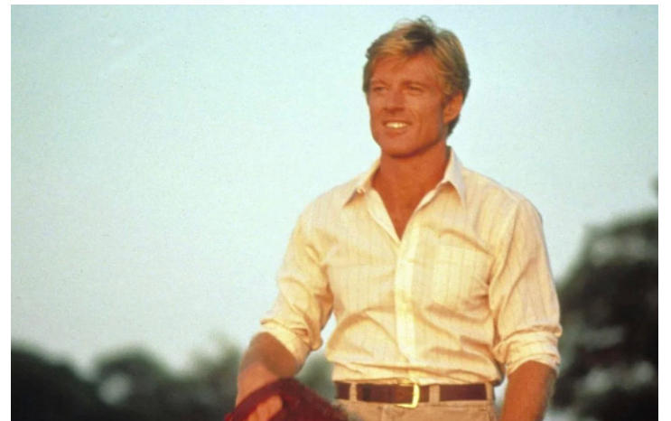
ROBERT REDFORD IN "The Natural."