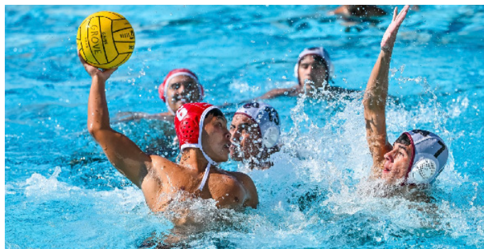
GARDEN GROVE (red) defeated Segerstrom 15-11 in a recent non-league water polo match (GGUSD photo).