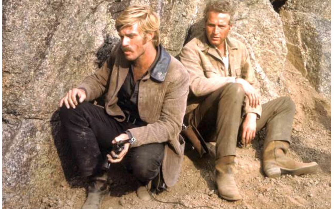
ROBERT REDFORD and Paul Newman in "Butch Cassidy and the Sundance Kid" in 1969.

Redford and Jane Fonda play a passionate but mismatched new-