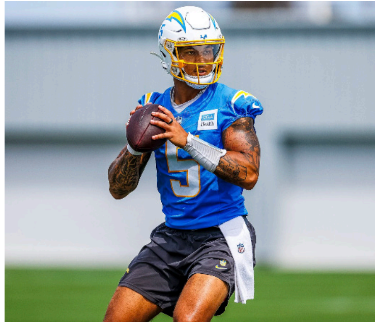
IT'S DEFINITELY SHORTS weather as Justin Herbert practices for the Chargers get ready to play the Denver Broncos this Sunday at SoFi Stadium.

"Obviously, there are things to clean up, but I like the direction we're going," quarterback Justin Herbert said. "As long as we're moving forward, keep getting better, I like the things that this team can do."