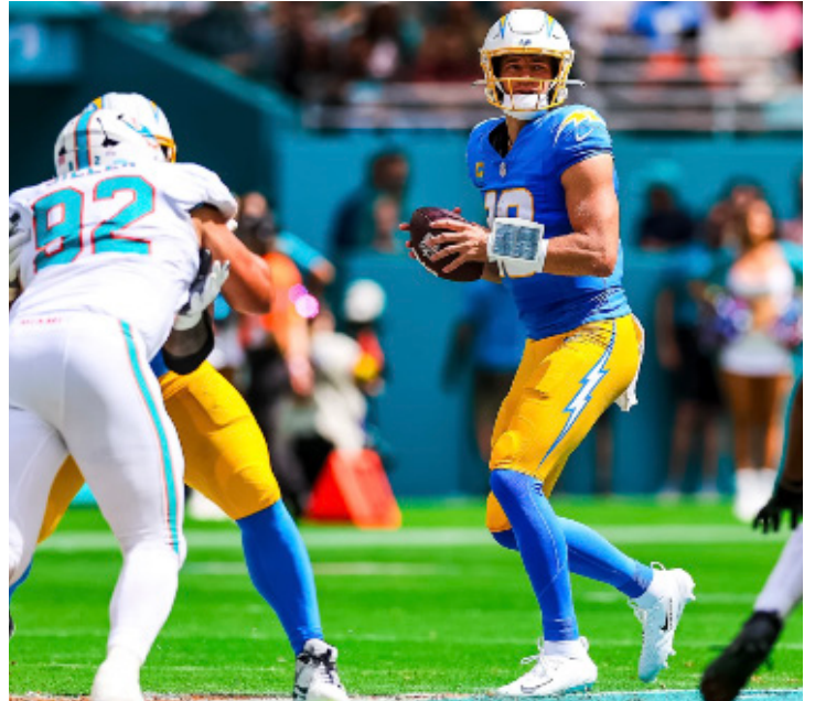
JUSTIN HERBERT was Hercules for the Chargers in tense win over Dolphins last week.

His mix of moxie and athleticism has never been in doubt since the Chargers drafted Herbert sixth overall in 2020, but rarely has he had a complete supporting cast capable of allowing the Oregon