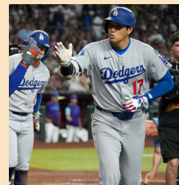
Ohtani goes deep as Dodgers sweep