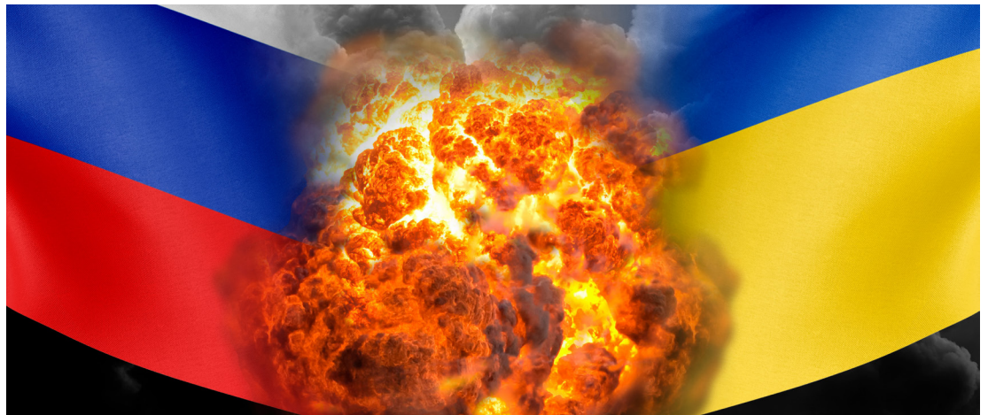
THE WAR BETWEEN Russia and Ukraine has been going on for three years.

According to the Associated Press, the president made this post on his Truth Social: "Enough blood has been shed, its property lines being defined by War and Guts. They should stop where they are. Let both claim victory, let History decide."