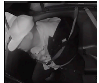
THE SUSPECTS in death of James Barrios.