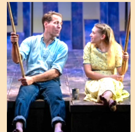
'The Diviners' shines at GWC