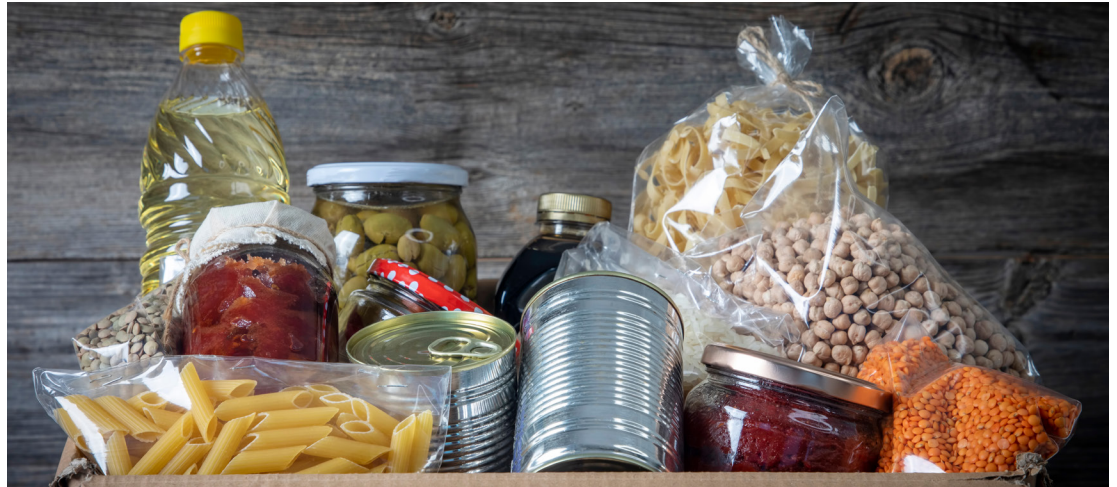
FOOD ASSISTANCE benefits millions of Americans.

Due to the government shutdown, the program was planned for a freeze on SNAP as of Nov.1, but the judges – one