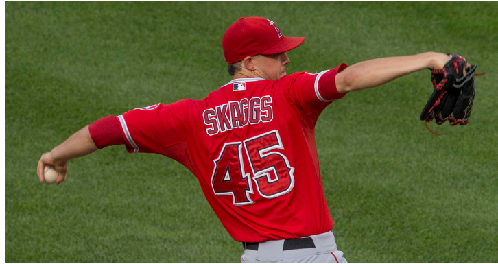
TYLER SKAGGS, former Angels pitcher