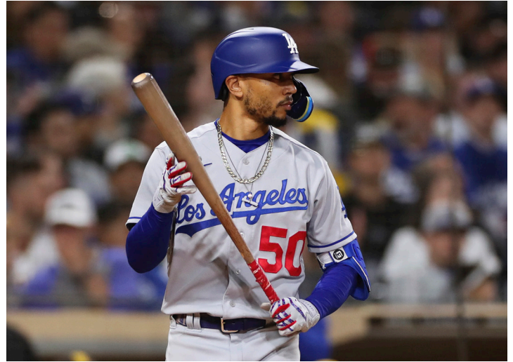
MOOKIE BETTS got the key hit in the Dodgers' 3-1 win in Toronto on Friday night.

Double play and the game was over and the Dodgers were able to force a Game Seven Saturday