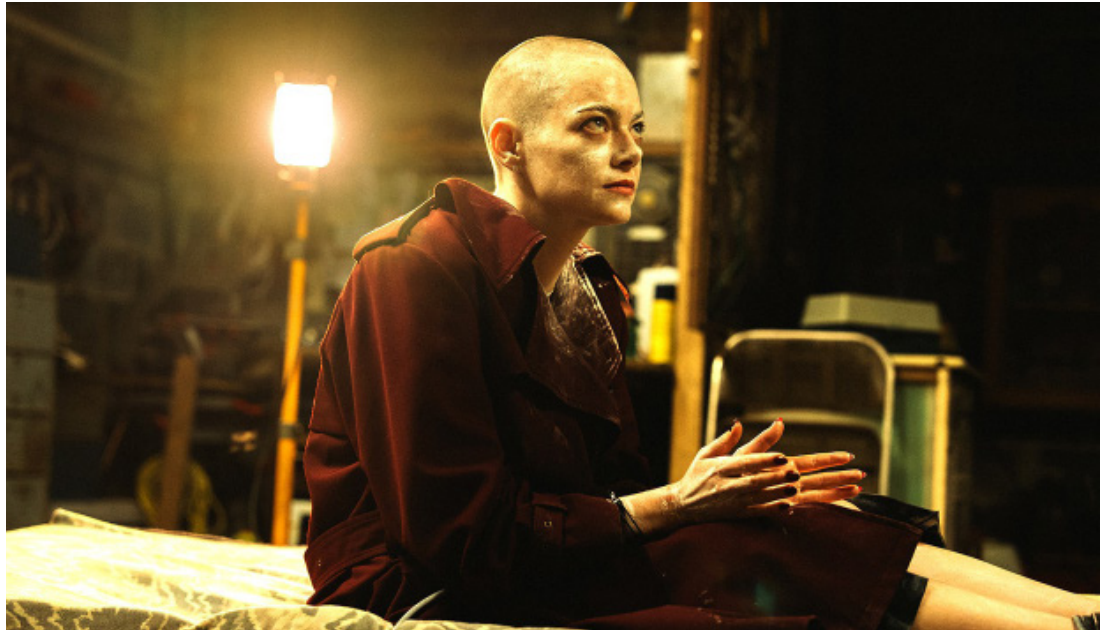
EMMA STONE stars in "Bugonia" (Focus Features).

But as Plemons so deftly plays him, Teddy doesn't seem like a lunatic. He might reach wildly insane conclusions, such as that Michelle, a pharmaceutical company chief executive, is an alien. But he's thoughtful in nature and sweetly cares for his cousin. It's a feat of Plemons' innate good nature that we kind of like Teddy, even as he shaves Michelle's head, to prevent "it," as he calls her, from contacting the mother-ship.