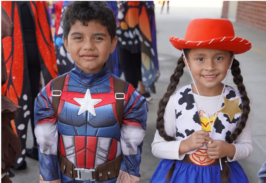
COSTUMES at Warren Elementary School in east Garden Grove brought out a colorful and diverse array of Halloween garb.