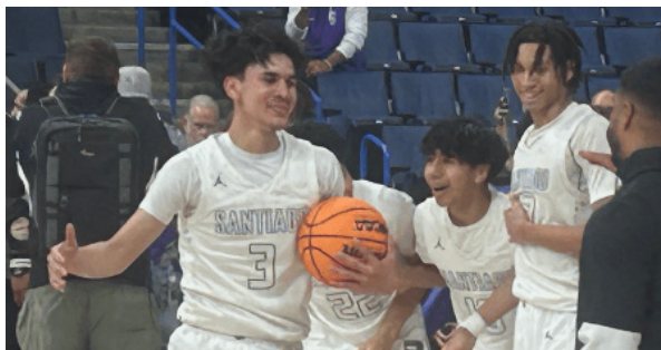
SANTIAGO won the schools' first boys CIF-SS basketball championship.

February: Republican Tony Strickland, Huntington Beach councilmember, won the 35th State Senate District seat ... The Huntington Beach City Council approved the placement of a plaque in the Central Library featuring the crostic of "MAGA" ... Also at Surf City council meeting a speaker