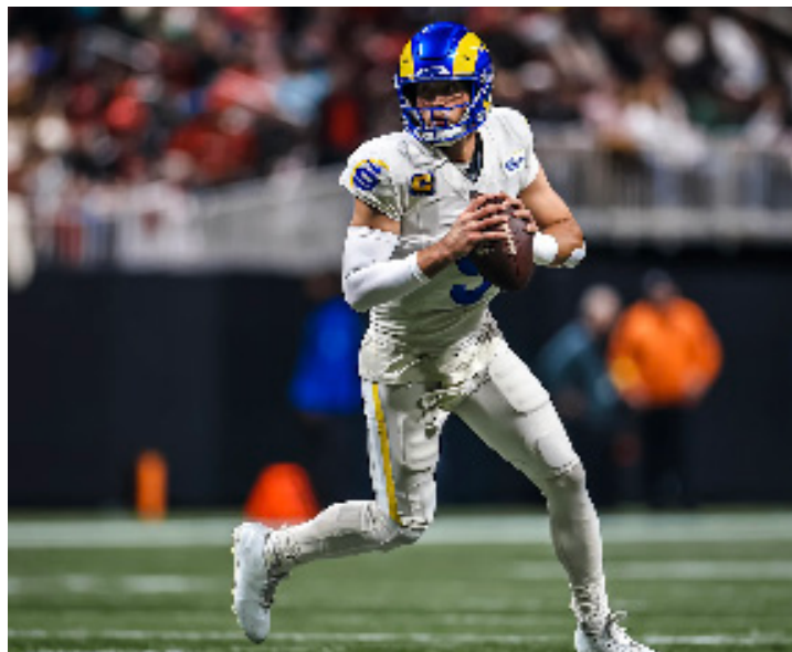
MATT STAFFORD passed for two TDs, but threw three interceptions in Rams' loss to the Atlanta Falcons.