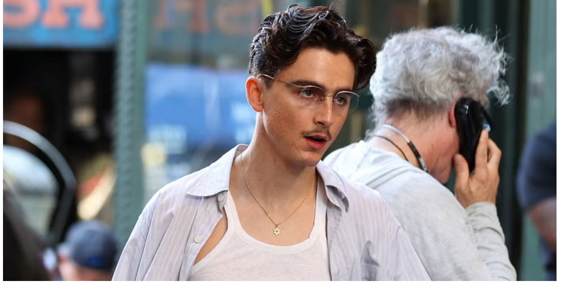
TIMOTHEE CHALAMET stars in "Marty Supreme" (A24 release).

This witty opening sequence won't be the only thing recalling "Uncut Gems," co-directed by Safdie with his brother Benny before the two split for solo projects. That film, which feels much like the precursor to "Marty Supreme," began as a trip through the shiny innards of a rare opal,