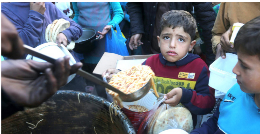
THE WAR between Hamas and Israel has created a big humanitarian crisis (File photo).

But the aid organizations reply that the new rules will slow the flow of help of desperately