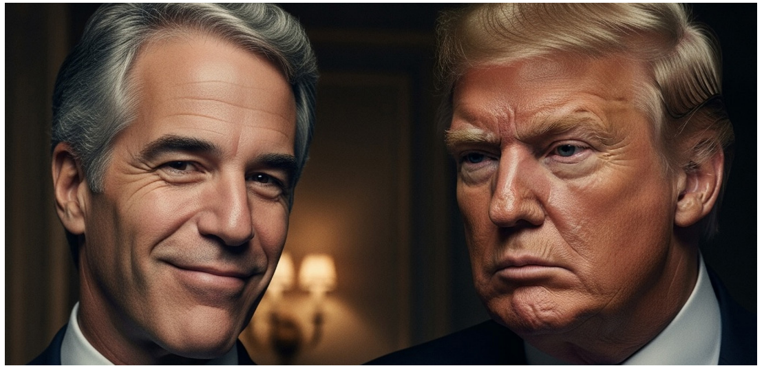
PRESIDENT Donald Trump and Jeffrey Epstein.

The material released included photos of former President Bill Clinton with Epstein, but little about another Epstein friend, President Donald Trump.