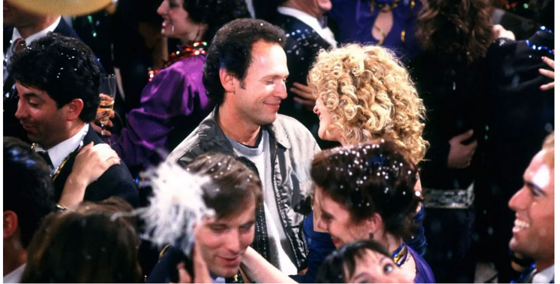
'WHEN HARRY MET SALLY' starred Billy Crystal and Meg Ryan.

"There's a fine line between stupid and clever," Christopher Guest's guitarist Nigel Tufnel observes in "This Is Spinal Tap" and Reiner's almost entirely improvised film about a British heavy metal group's disastrous tour is proof. In its unabashed commitment to silliness, it captured truths about rock 'n' roll, the music industry and ego. Reiner even