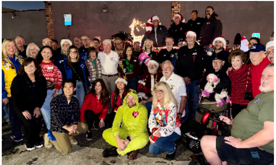
Participants in the Fourth Annual Toy Drive held on Dec. 12 on Garden Grove's historic Main Street included folks from the Kiwanisland of Garden Grove, the Historic Friday Night Cruise, other organizations, city leaders and more. For another photo and more information, see photo and caption on page one.