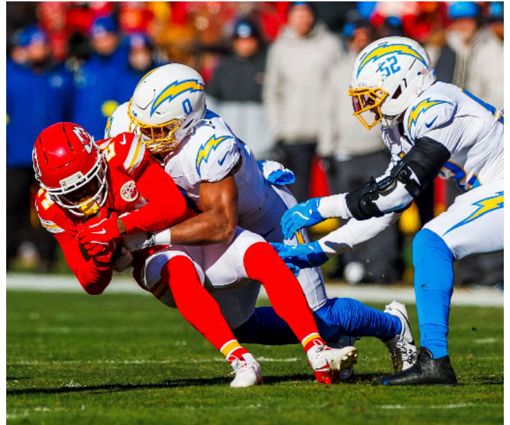
DEFENSE has been a big part of the Chargers' success this season.

To complete the Chargers' season sweep of the Chiefs, the de-