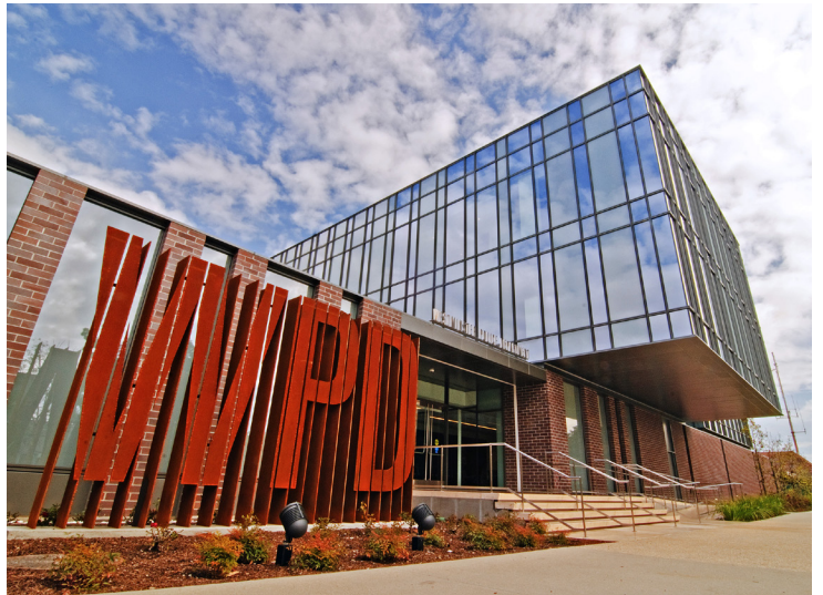
WESTMINSTER POLICE Department building in the Civic Center.

clined from three to two (down 33.33 percent). Declines were