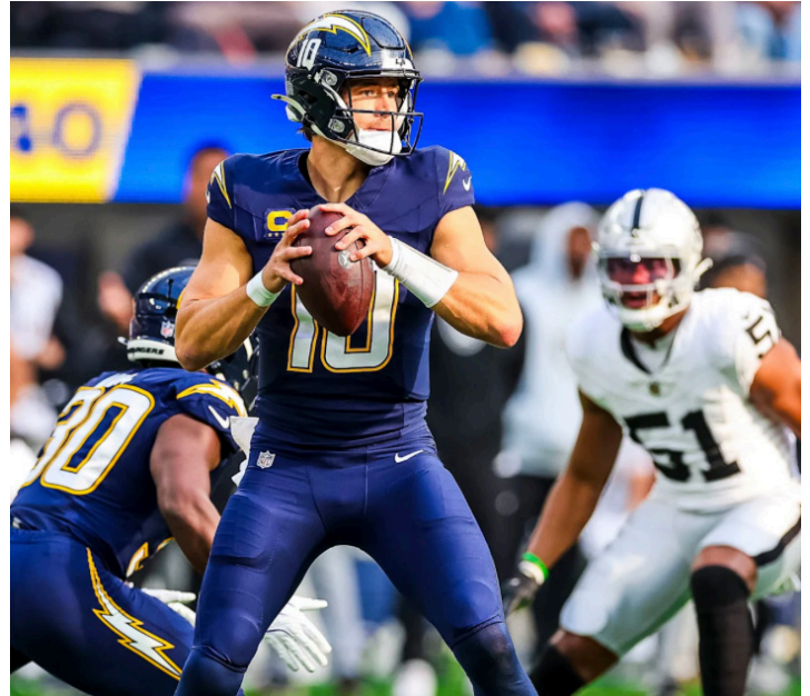
JUSTIN HERBERT injured his left (non-throwing) arm, casting a shadow over a win over Raiders.

“The doctors were happy with how they performed, so I guess that's always a good thing,” Herbert said. “It's just the next couple days of seeing how the swelling handles and what goes on from there.”