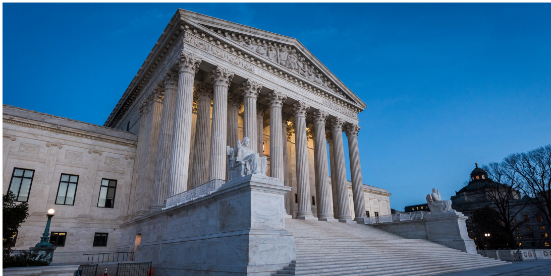
THE CONCEPT of "birthright citizenship" will go before the Supreme Court.

The New York Times is reporting that the court has decided to settle a lawsuit over a Trump Administration executive order claiming that children born of undocumented immigrants and some temporary foreign residents should not be automatically granted citizenship.