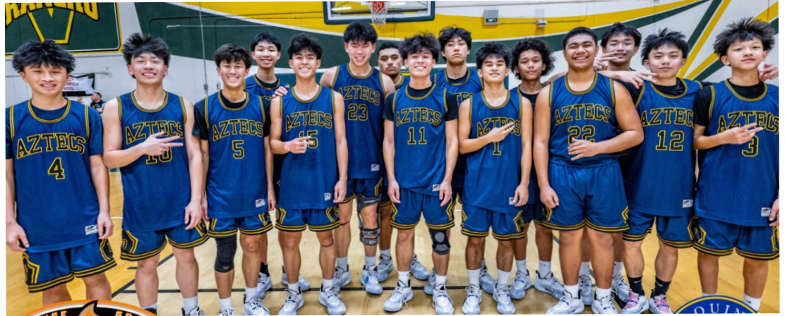
THE LA QUINTA AZTEC boys' basketball team has won its second consecutive championship, topping the Grove League with a 6-2 league mark and an overall 16-11 record. The blue-and-gold started the season slow with six losses in seven games, but then rallied, winning five of six contests, including a 58-53 overtime win over Saddleback in the Roadrunners' gym.