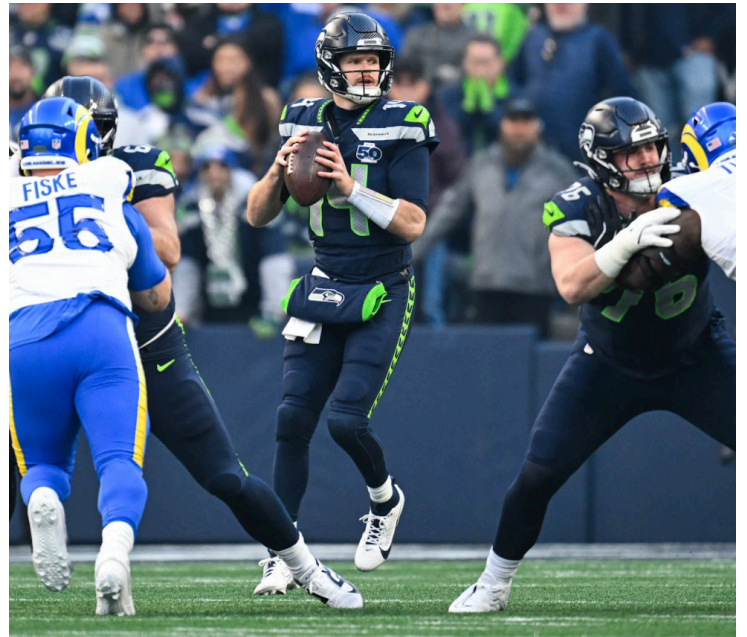
SAM DARNOLD led Seattle to a narrow win over the Rams. Seahawks are favored over the Pats.