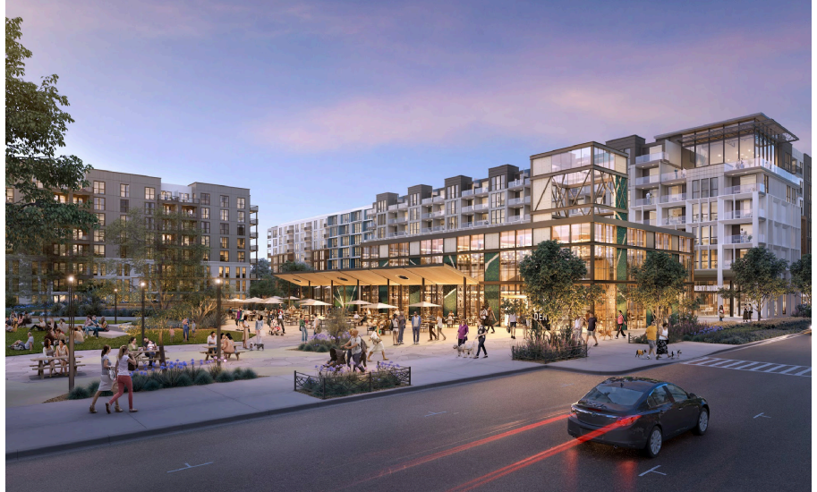
ARTISTS RENDERING of the Bolsa Pacific mixed use development planned to replace the closed Westminster Mall (Shopoff).

planned to include 2,250 housing units (for sale and market-rate and affordable housing), a hotel and 220,000 square feet of new retail. Over 15 acres will be devoted to open space.