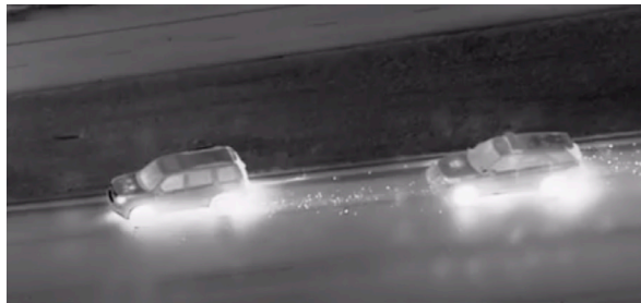
TIRES ON stolen vehicle are ripped as Huntington Beach units close in

With help from HB1—the HBPD's helicopter—the vehicle was tracked and