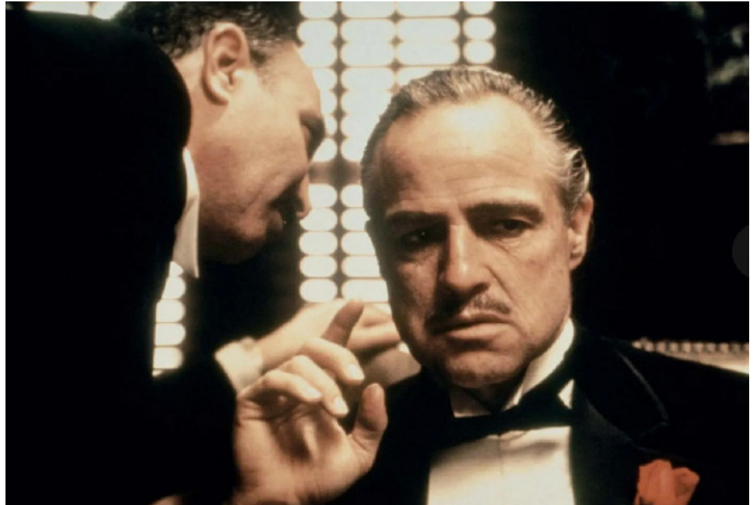
MARLON BRANDO in the first "Godfather" film (Brittanica).

In 2012, the movie studio sued to block publication of Ed Falco's "The Family Corleone."