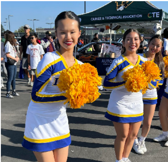
THE GARDEN GROVE Unified School District celebrated its 60th Anniversary with an event at Bolsa Grande Stadium on Friday. La Quinta and other cheerleaders welcomed attendees.