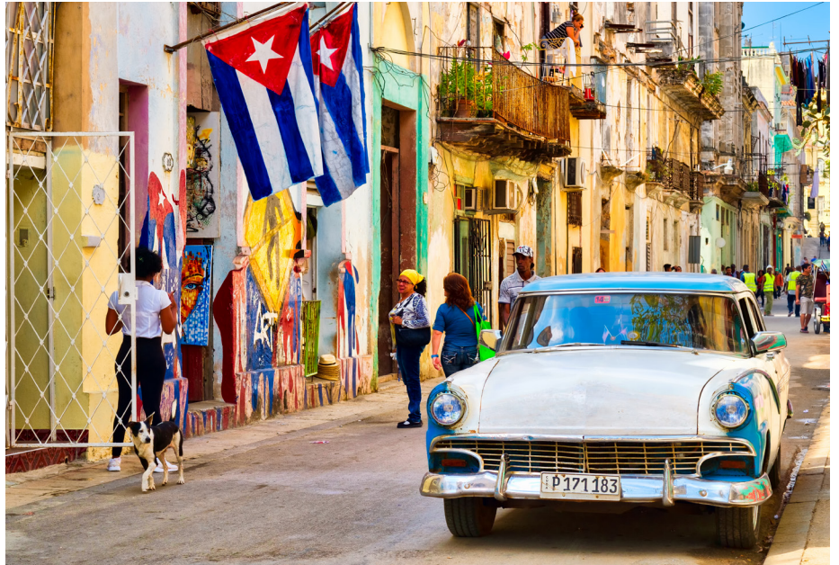
CUBA is the subject of an economic blockade (Wikipedia).

The AP has reported that the U.S. Attorney in Florida is seeking to build legal cases against leading Cuban officials.