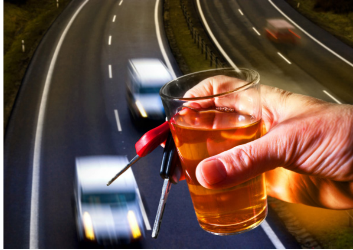
THE HBPD WILL BE holding a CDL/DUI Checkpoint on Thursday, May 28.

But if you don't, what does that say about you as a patriot, or son or daughter?