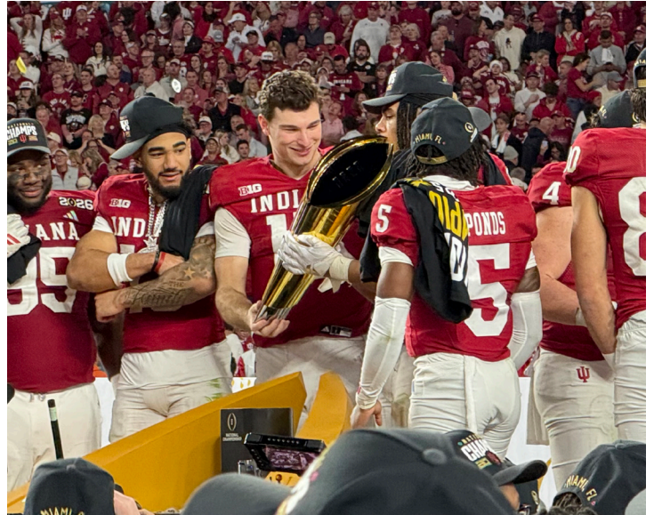
FERNANDO MENDOZA and the 2026 champs