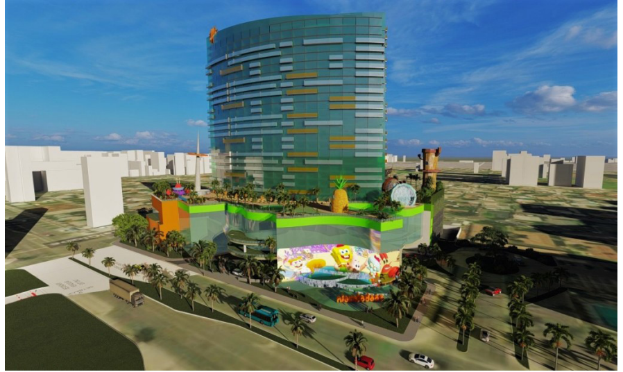
GARDEN GROVE CITY COUNCIL will consider a second reading and adoption for a planned unit development for the long-delayed Nickelodeon project.

Also on the agenda is an Orange County environmental update and a Community Spotlight in recognition of first responders, city employees and response partners for their service during the hazardous materials incident at GKN Aerospace on Western Avenue over the Memorial Day weekend. The council will meet at 6:30 p.m. in the Community Meeting Center, 11300 Stanford Ave.