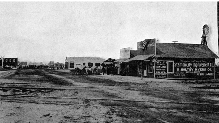
EARLY Stanton in 1913. Notice railroad tracks in foreground.

The council OKd an ordinance on “public participation and disruptive behavior.”