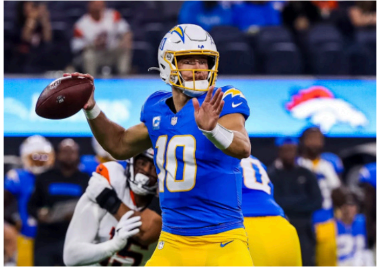
LOS ANGELES CHARGERS Justin Herbert is training to lead with his non-dominant left foot.