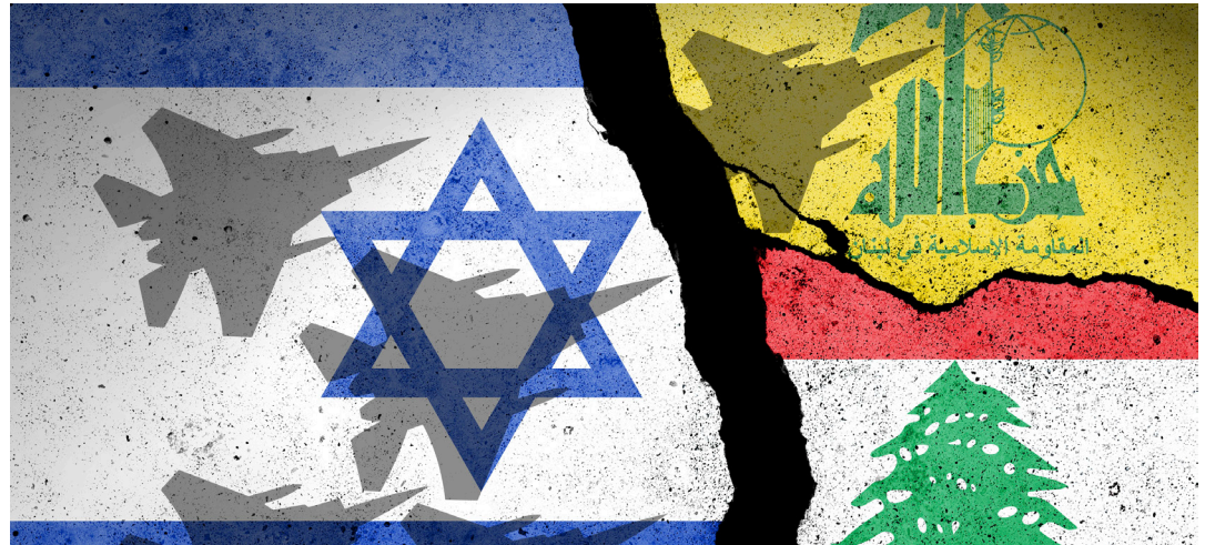
A CEASE-FIRE between Israel and Hezbollah proved short-lived.

Aoun said the attacks “threatened to sabotage current efforts to get a cease-fire in place and