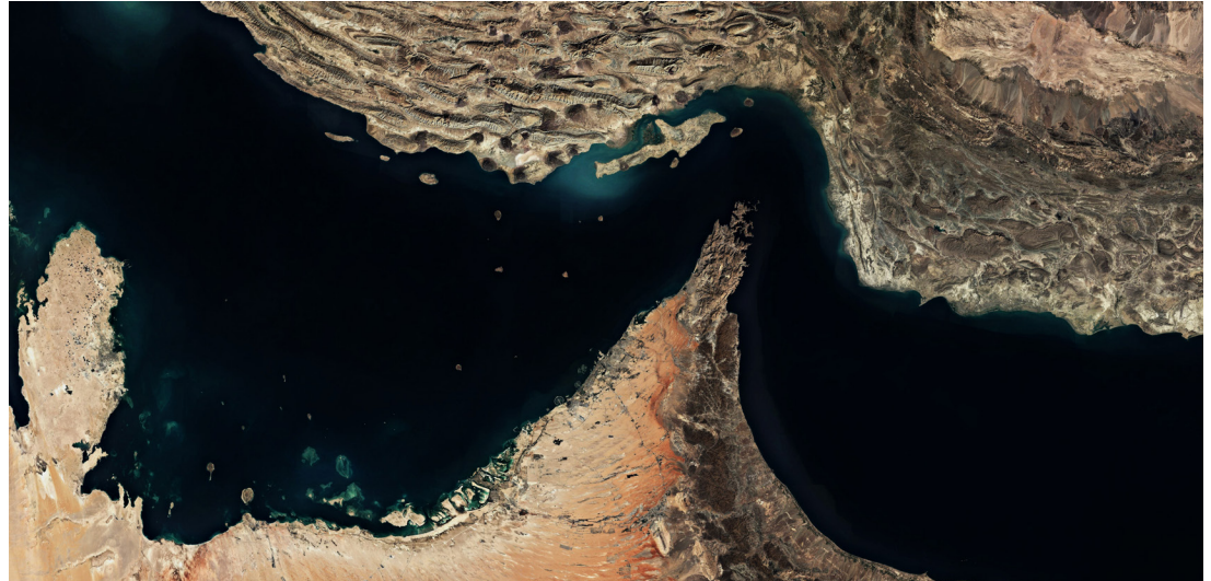
THE STRAIGHT of Hormuz, as seen from space.

If peace does come from this latest announcement, it will take place after several announcements of "cease-fires" which have ended in violence.