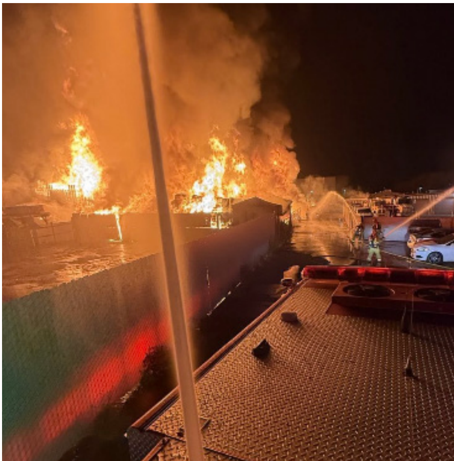
ORANGE CITY firefighters, along with mutual aid partners such as Anaheim Fire and Rescue, battled and eventually extinguished this 3-alarm fire on North Batavia Street in Orange. For a story and additional photo, see page three.