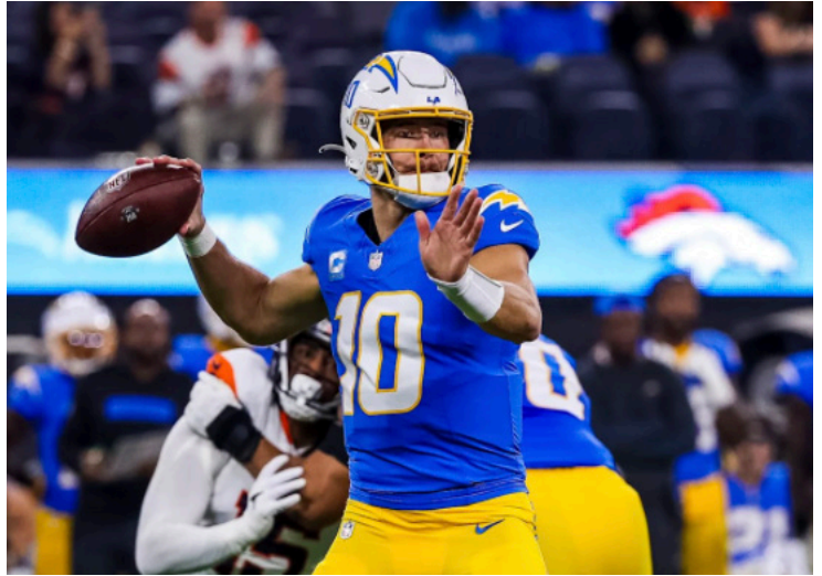
JUSTIN HERBERT took a lot of hits in 2025.

McDaniel's emphasis on quick throws is shaping up to be one of the biggest difference in the Chargers' new offensive scheme, which is intended to limit the pass rush Herbert faces and better make the most of the array of skill players around him.