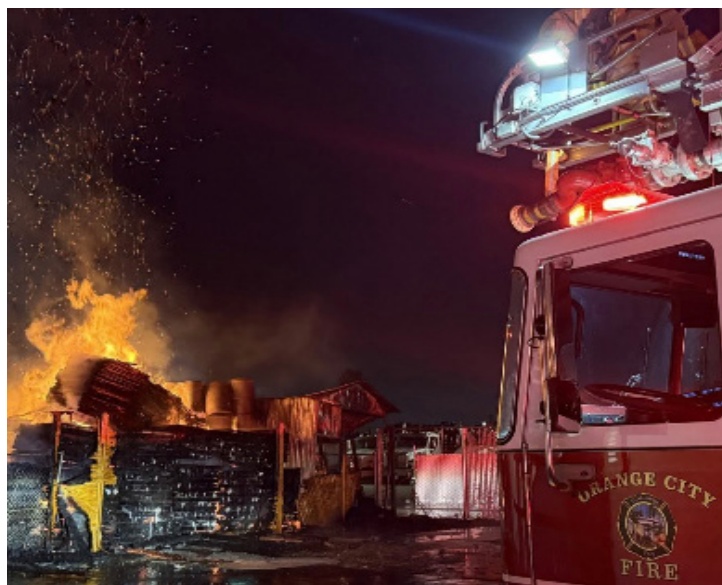
WOODEN PALLETS ablaze in Orange on Wednesday on North Batavia Street. Additional photo on front page.

Journalists and campaign managers agree, though: "We don't wanna."